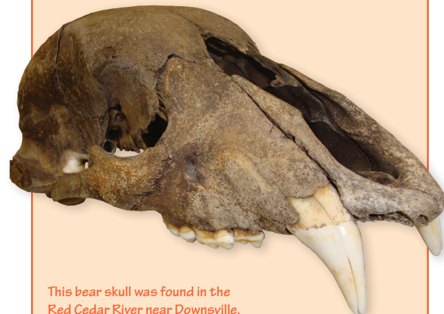
This bear skull was found in the Red Cedar River near Downsville.

Remember, you can do some research, and if you can tell not only what you know, but how you know it, that earns more points. For example, if you find an animal skull, try and find out what kind of animal it was, and tell us why you think that. Use your finder skills to research and learn!